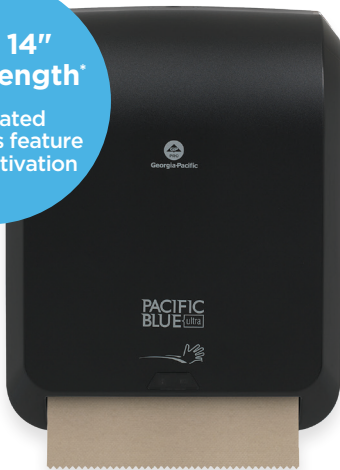
Automated Towel Dispenser

Automated Dispensers feature motion activation