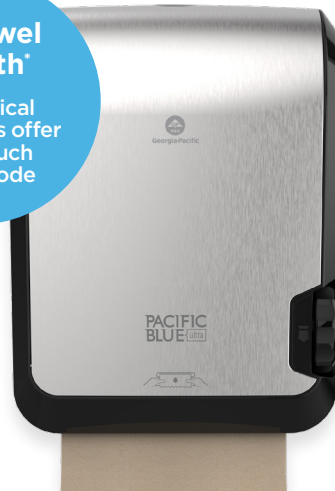
Recessed Mechanical Towel Dispenser

Mechanical Dispensers offer a no-touch hang mode