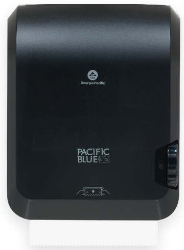
Mechanical Towel Dispenser