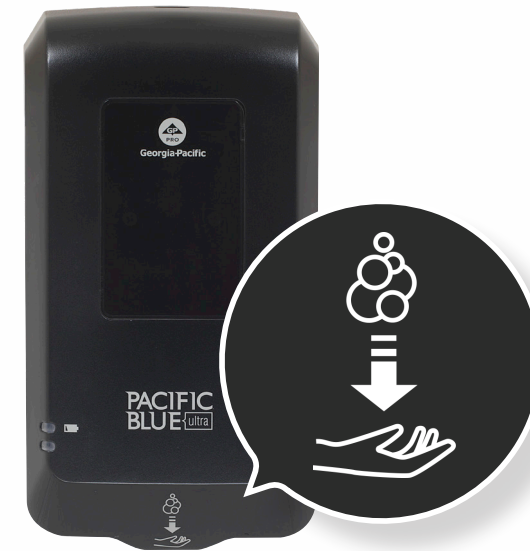
53590 Pacific Blue Ultra® Automated Soap/Sanitizer Dispenser