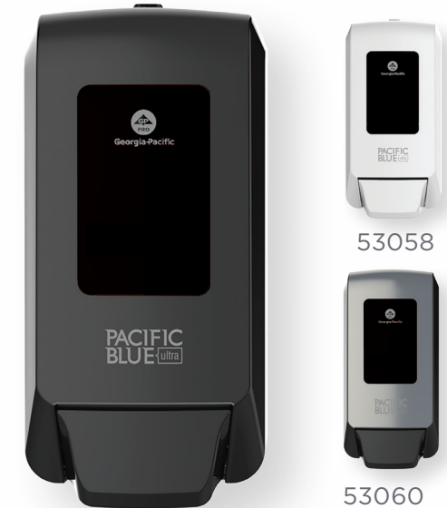
53057 Pacific Blue Ultra® Manual Soap/Sanitizer Dispensers