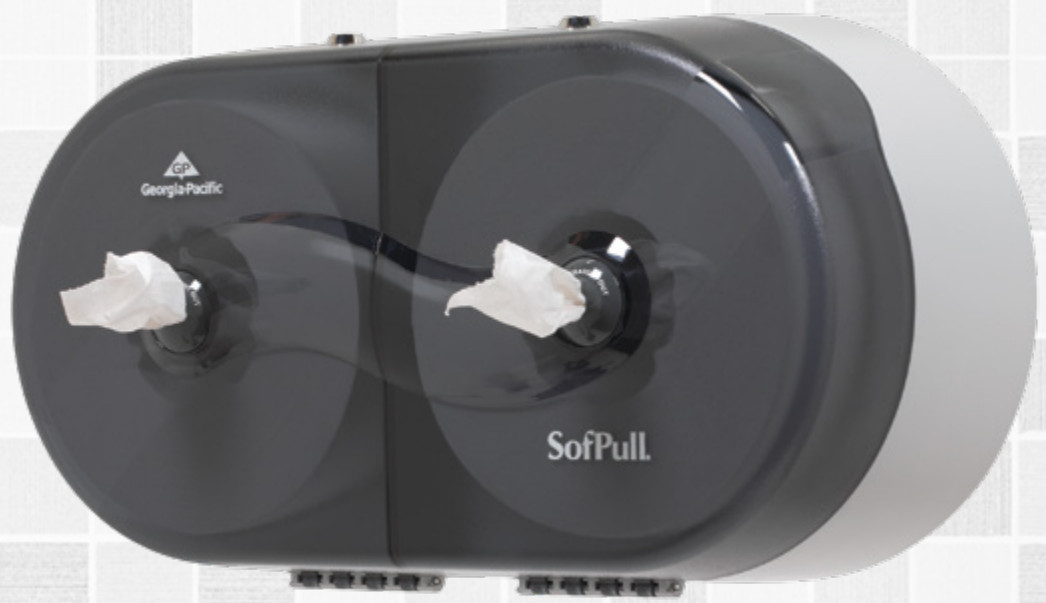
SofPull® Twin High-Capacity Centerpull Toilet Paper Dispenser 56509